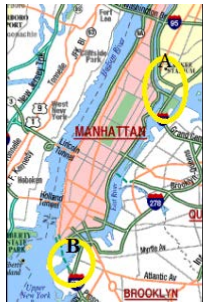
Map 01. Sample stations in relation to Manhattan. The section labelled as "A" refers to the Harlem/ East River experimentation sites, while "B" refers to the Governors Island control site.