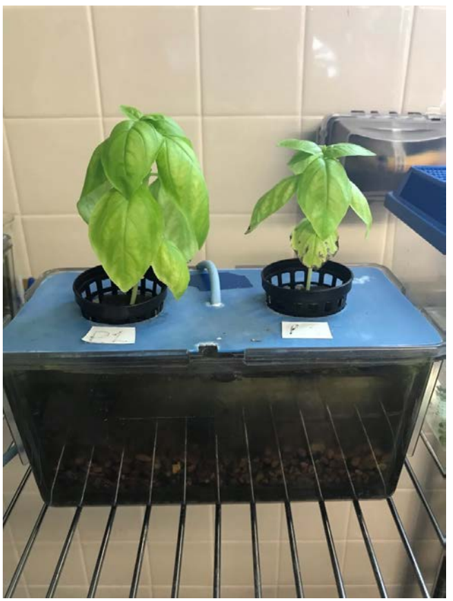
Figure E (Basil plants #1 and #2 (Ocimum basilicum))