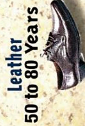
Leather 50 to 80 Years