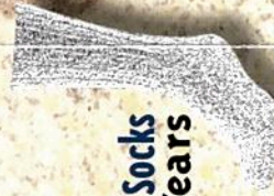
Wool Socks 1-5 Years