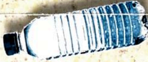
Plastic Containers 450 Years