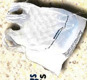
Plastic Bags 10-20 Years