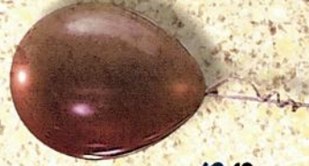
Balloons 6 months