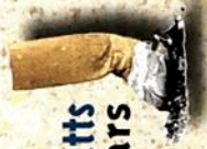
Cigarette Butts 1-5 Years