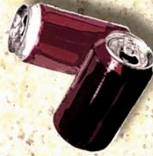
Aluminium Cans 50 Years