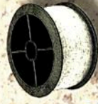
Nylon 600 Years