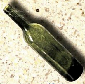
Glass Bottles 1,000 Years